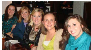
Dinner club at Urban Flats, October 2009

Returning to our calendar this year are the Dinner Club, Lunch Bunch,